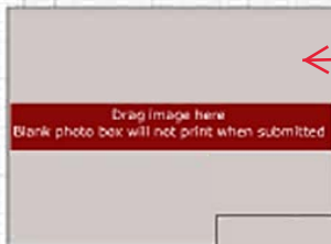
Photo 4 Caption, 9 pt. Lorem ipsum dolor sit amet, consectetur adipiscing elit, sed do eiusmod tempor incididunt ut labore et dolore magna aliqua.